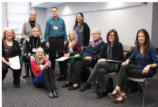
2014 Workshop - Team of Careholders

This workshop provides us with a special opportunity to build creative collaboration grounded in mutual care and dignity. Please visit last year's workshop webpage to see how we go about this event.