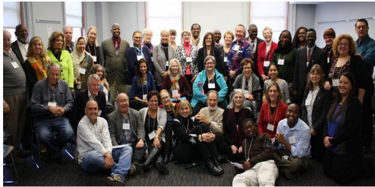
2014 Workshop at Columbia University

Columbia University, Teachers College, New York City